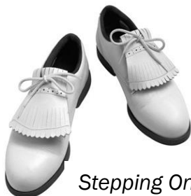
Stepping On Logo

Eighty-two percent (82%) of states said they promoted or kicked-off an evidence-based intervention as part of FPAD 2014. Of those reporting, the majority of states launched Matter of Balance, while others promoted Tai Chi: Moving for Better Balance (now known as Tai Ji Quan: Moving for Better Balance ), Otago, and Stepping On.