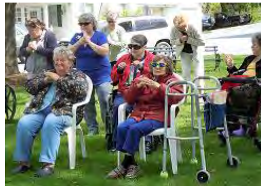
Left: Tai Chi for Arthritis Falls Prevention, Bristol, VT. Right: Tai Chi for Arthritis falls prevention demo in Vergennes at a community meal site.