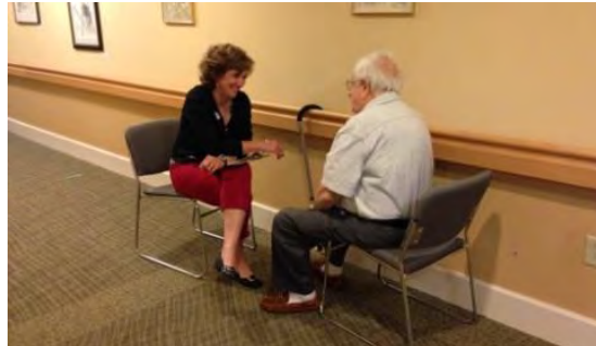
Left: Tai Chi demo with participants waiting to be screened. Right: screening event.

Key outcomes reported included: Expansion of partners and building upon collaborations; creating interest in membership of the Falls Free Coalition of Vermont; and working with the Governor's Commission on Successful Aging, Health Care Reform sub-committee to submit key findings and recommendations regarding the creation of a State Plan on Falls Prevention.