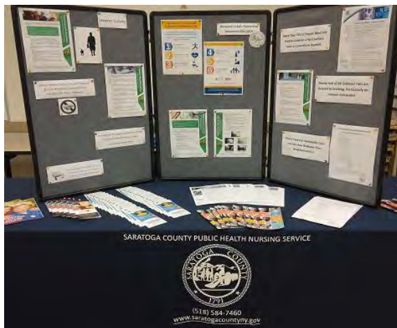
Saratoga County Public Health falls prevention information booth

New York City participated in a creative partnership with NCOA and F.Y. Eye to produce a falls prevention public service announcement that was carried through nonprofit video feeds in senior centers and other venues.