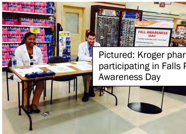
Pictured: Kroger pharmacists participating in Falls Prevention Awareness Day