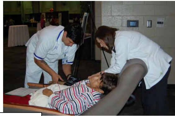
Wellness Expo Photos