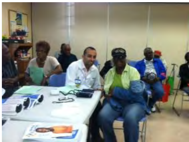
Pictured: A Walmart pharmacist reviewing medications with an at-risk senior.

DC's Falls Prevention Awareness Day activities at the sites included falls prevention education/awareness, speakers on home safety, Timed Up and Go tests, strength tests, physical therapists and occupational therapists available for consultation, medication reviews, and vision testing. Assessments were delivered by a broad array of partnering physical therapists (and students), occupational therapists, pharmacists, and optometrists. An ophthalmologist provided an overall review of risk factors with recommendations for follow up.