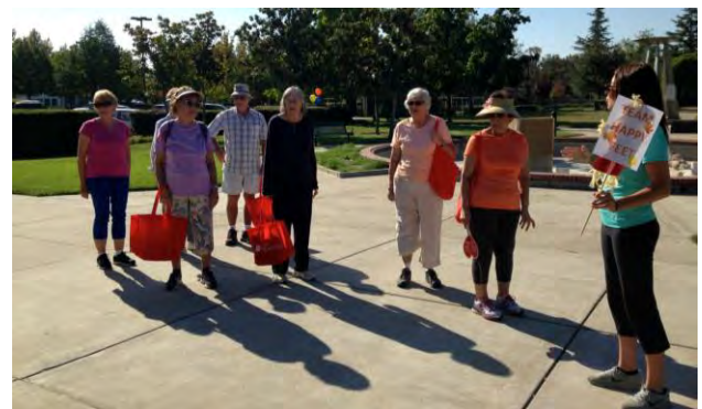
Alameda County Walk—Posters throughout the walk were displayed educating the seniors who participated.

For the second year in a row, the nonprofit LIFE ElderCare choreographed a flash mob dance for seniors and people of all ages at the New Park Mall Shopping Center in Newark/Fremont, CA during Fall Prevention Awareness Week.