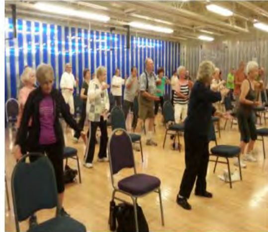
YMCA Tai Chi Demonstration, Beaverton