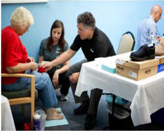
Kaiser Health Fair, Portland