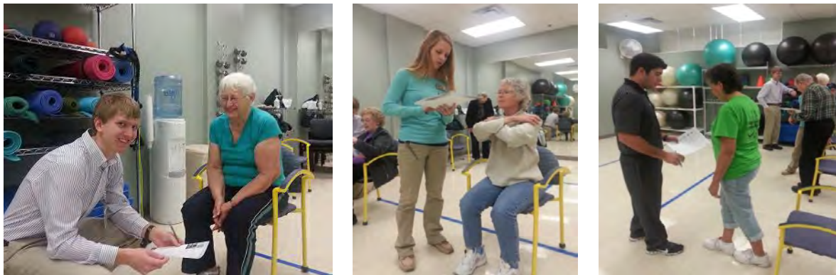
The photos are of students participating in the STEADI assessment at the Altru Medical Fitness Center.

At the Grand Forks Senior Center, after the falls prevention education session and screening events, partners were asked to present again to another two groups (a Diabetes group and a TOPS group). The students accepted the challenge and used that as their required in-service project!