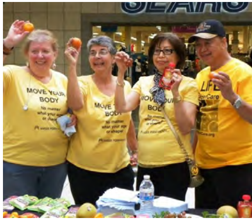
Alameda County's 2014 FPAW activities

Alameda County Public Health video featured Alameda's Fall Prevention Center Open House & Fair at Highland Hospital FPAW.