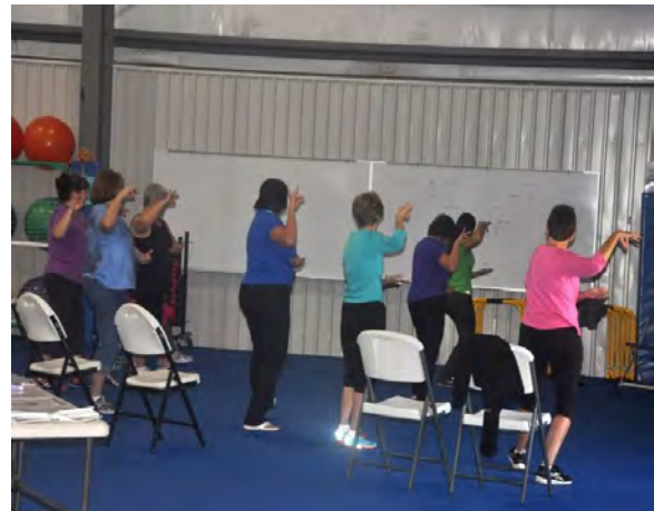
Tai Chi demonstration—as part of the awareness activities, Maryland promoted Tai Chi: Moving for Better Balance and Stepping On

In addition, the Elkton Center and the Healthy Lifestyle Fitness Center hosted balance exercise programs, and senior centers in Charles County offered falls prevention lectures and exercises. The Eastern Shore Area Health Education Center/University of Maryland, Baltimore Geriatrics and Gerontology Education and Research Program/Johns Hopkins Geriatric Education Center Consortium offered a two part educational presentation on frailty and falls.