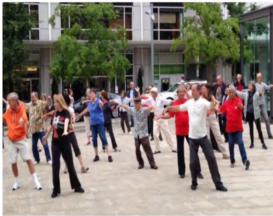
Tai Chi Flash Mob, Portland