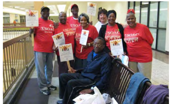
USOAC Walking Club promoting fall prevention awareness