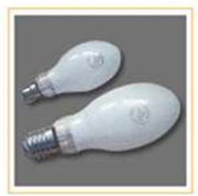
High pressure sodium